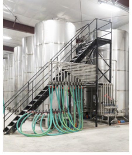
An automated tote repackaging area means the location can fill small totes in addition to large

"One of the reasons we chose Murray Equipment was their ICS Controls. It ties in with our accounting and agronomy software for more accurate billing and invoicing," Day remarked. "By using the same software across the company we are able to train employees to work across all our locations as well as collaborate together on best practices."