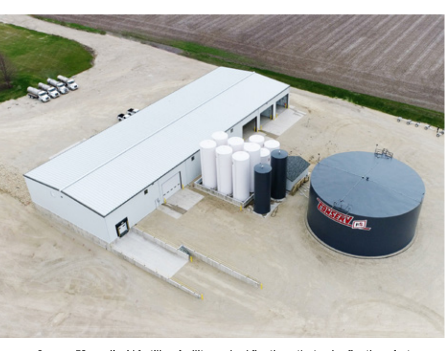
Conserv FS new liquid fertilizer facility can load five times the trucks, five times faster.