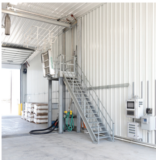
The third unattended bay is accessible 24/7. It is used by GRAINCO and area growers to transport product round the clock and offers both top and bottom load-out.