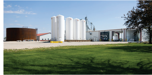
The location features three load-out bays, 1.18 million gallons of liquid fertilizer, and 65,000 gallons herbicide.