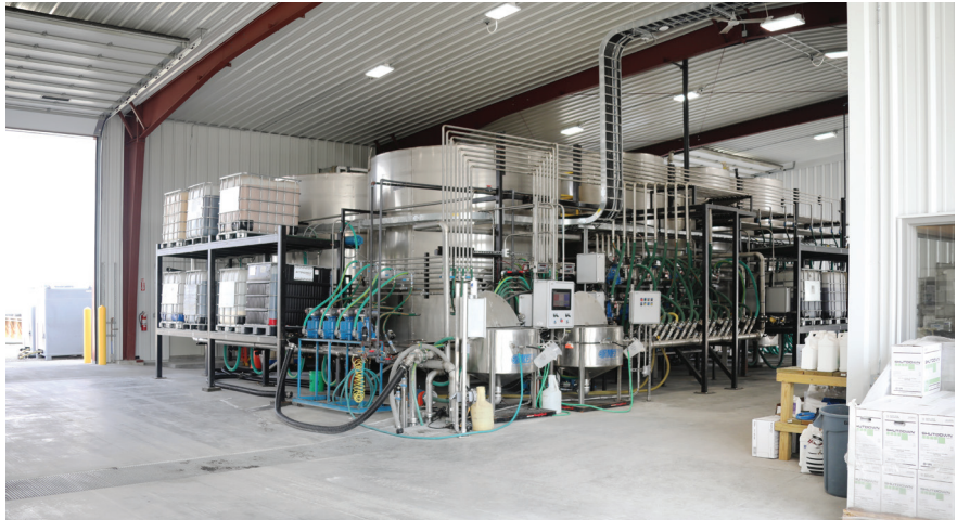
All the equipment, plumbing, metering, and controls were engineered by Murray Equipment. The goal was to offer an extensive line of liquid fertilizers, chemicals, and hot loads.

“It used to take 45 minutes to fill a semi. Now, the semi is in and out in under 15 minutes,” shared Mino. “Before we could only load in two bays, but now we can load in three.”