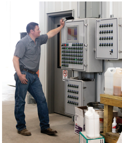
Production and load-out are controlled by ICS 240c with two expansions, which are used to manage the large number of customer blends.