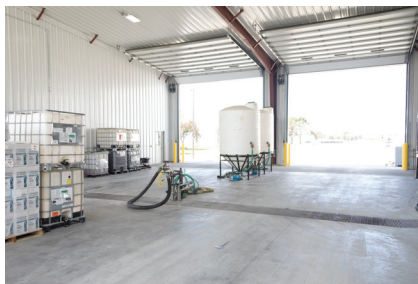
The facility features two bottom load attended bay that specialize in hot loads.