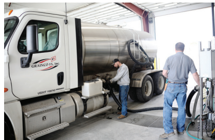
Semis can be loaded in less than 15 minutes. Previously it would take more than 45 minutes.