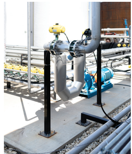
MEI's unparalleled understanding of both equipment and automation is behind this neat, convenient, and compact facility layout.