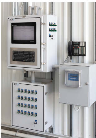
The intuitive ICS 24-7-8 Controls verify drivers and equipment. The same ICS Control Pro software that runs the facility is used in the touchscreen control panel for seamless operation.