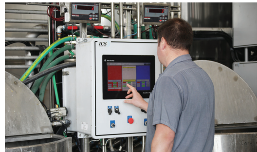
A conveniently located touchscreen panel allows employees to quickly create accurate batches.